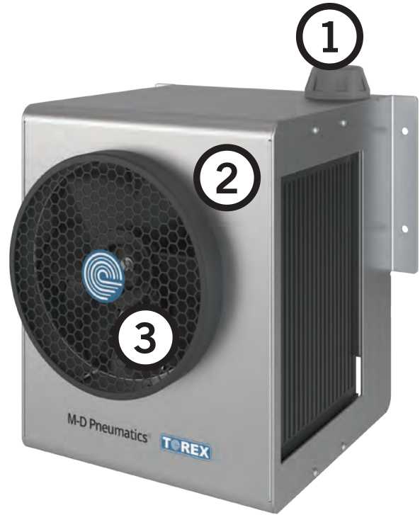
TOREX hydraulic oil cooler exterior.